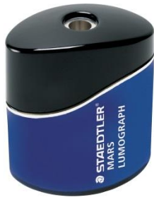
1 individual pencil sharpener