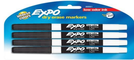
3 Dry thin black erase markers