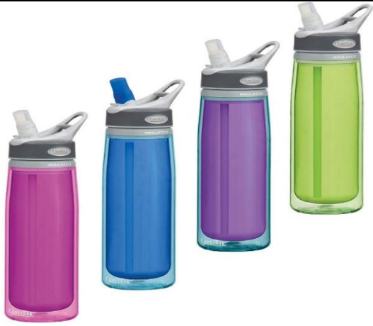
Water bottle (bring fresh daily)