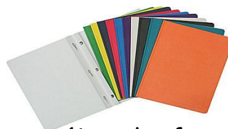
8 Duotangs (1 each of red, blue, yellow, green, orange, purple, white and black)