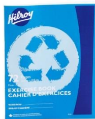
4 Hilroy plain 72-page exercise book