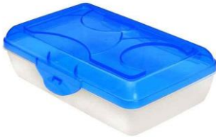
1 Hard Plastic pencil box