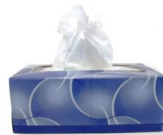
2 Boxes of facial tissues