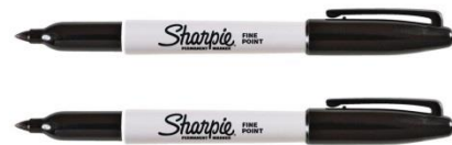
2 pack black fine point sharpie