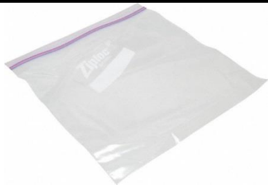
1 X-large, 3 Large and 3 Medium Ziploc Bags