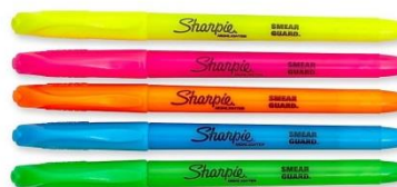
4 Highlighters (blue, yellow, pink, and orange)