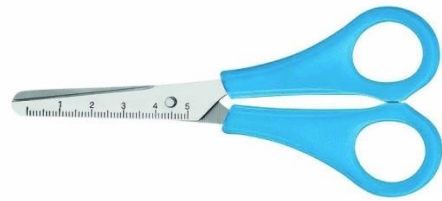
1 Pair child's scissors